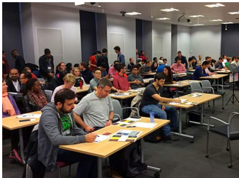
100-120 Postgraduate Freshers gather with 11 Cranfield Speakers members and 7 Visiting Toastmasters for the 2017 Open Night

Both last year and this year we had approximately 100 students at our open demo meeting. At the open demo night, we focus on a shorter program with an example of an experienced speaker and a beginner as well as fun accessible table topics, well explained roles, and a strong