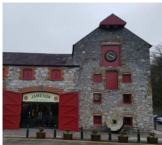
THE USUAL SUSPECTS