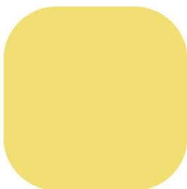
TBC Video Editor

Looking for your next step beyond your club