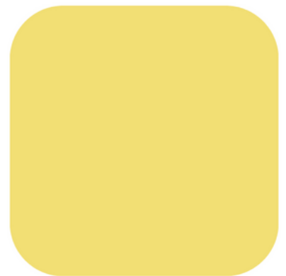
TBC Graphic Designer/ Content Creator